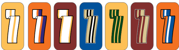
23NC (2 Color / 3 Stripe) 33NC (3 Color / 3 Stripe) *23WC (2 Color / 3 Stripe) *35WF (3 Color / 5 Stripe) *25WF (2 Color / 5 Stripe) 24FF (2 Color / 4 Stripe) 34FF (3 Color / 4 Stripe)

Regular patterns for 1" neck and armhole trim, 1" cuffs and side inserts on singlets *5/8" trim available on 11, 22, 23E and 33E patterns only.