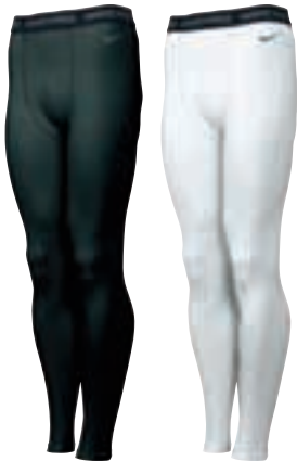
Nike Pro - c ore basic Tight

SIZES: S, M, L, XL, 2XL *15% upcharge for 3XL OFFER DATE: 06/01/10 END DATE: 06/01/13 Body fitting tight, perfect as a first-layer under athletic uniforms or training in cold conditions. Contrasting flat seam construction provides durability and clean finish. Strategically placed seams for enhanced mobility, less friction and zero distraction. Fabric is brushed on inside for maximum comfort and warmth. Swoosh design trademark heat transfer at lower left leg, Dri-FIT trademark heat transfer at upper right hip, Nike Pro jock tag at center back waistband. Inseam: 30.375 (size large)