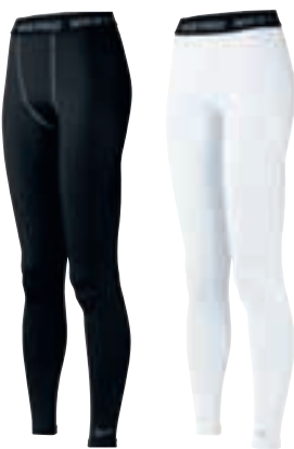
c old Weather Therma Tight